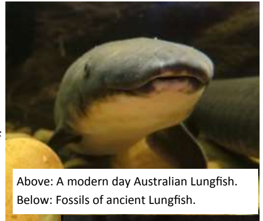
Above: A modern day Australian Lungfish. Below: Fossils of ancient Lungfish.

Lungfish tooth plates are the fossilised remains of ancient fish that lived during the age of dinosaurs. Interestingly, Australian lungfish were first described by their fossils before the living animal became known. Lungfish are often described as 'living fossils' due to being the most enduring vertebrate species on earth. Australia has a continuous record of lungfish from the Devonian up to present day.