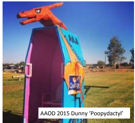
AAOD 2015 Dunny 'Poopydactyl'

The 200-metre Derby starts off Le Mans style with the jockey running to his thunderbox (seat) before the team pushes and pulls their dunny through the obstacles to the finish line. A five-person team consists of 2 runners pushing the dunny, two runners pulling the Dunny and 1 jockey riding on their thunderbox in the dunny.