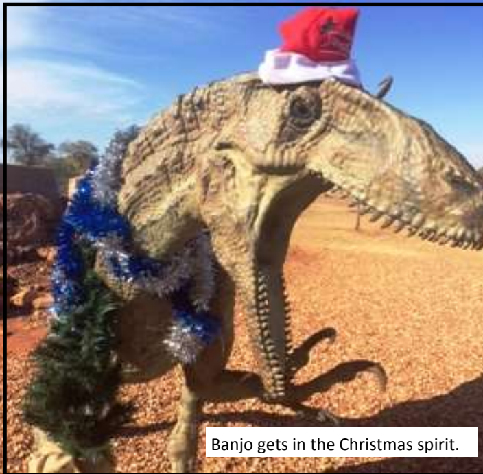
Banjo gets in the Christmas spirit.