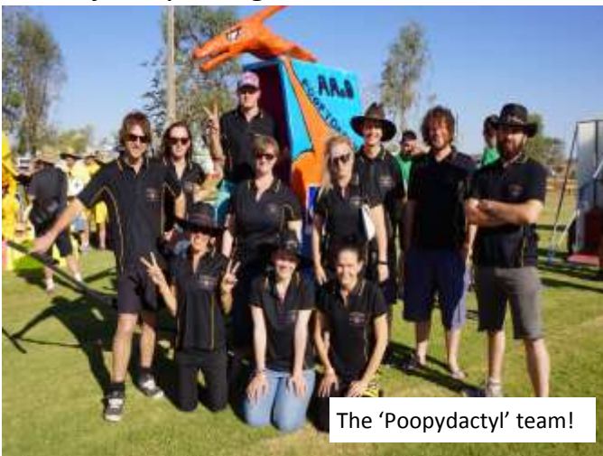
The 'Poopydactyl' team!

'Poopydactyl' made it into the Constipation Stakes (the BEST of the losers) where the team placed fourth overall. It was amazing to see how much effort the community put in to make this event and festival possible, with many locals going all out to get 'in the zone' for the derby. The Australian Dunny Derby was definitely a highlight of the week-long events!