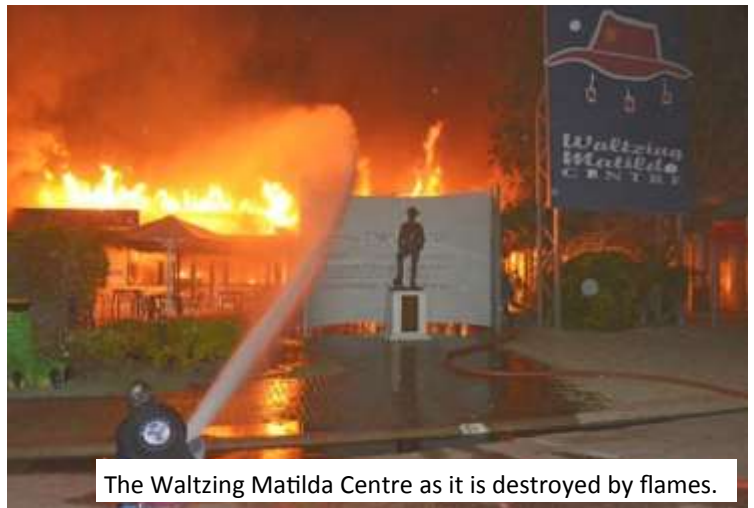
The Waltzing Matilda Centre as it is destroyed by flames.

During the early morning of Thursday 18 June 2015, the Waltzing Matilda Centre, located on the main street of Winton, was ravaged by flames. The historical building, which was dedicated to Winton's famous past, was significantly damaged before the local firefighters could extinguish the blaze. Once the remains of the site were declared safe, it was soon realised that most of the damage was confined to the main building and that the artefacts at the far end of the site were intact.