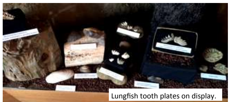
Lungfish tooth plates on display.