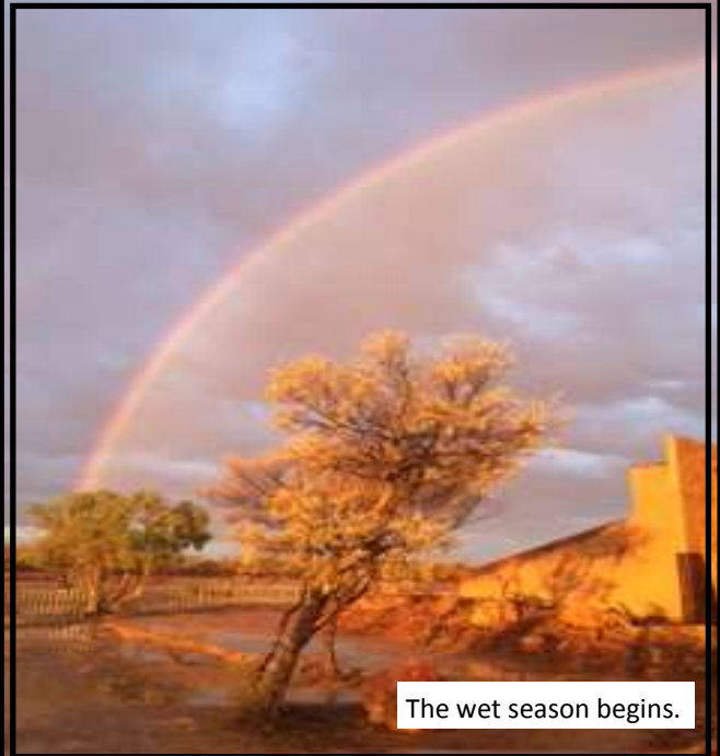
The wet season begins.