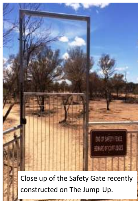
Close up of the Safety Gate recently constructed on The Jump-Up.