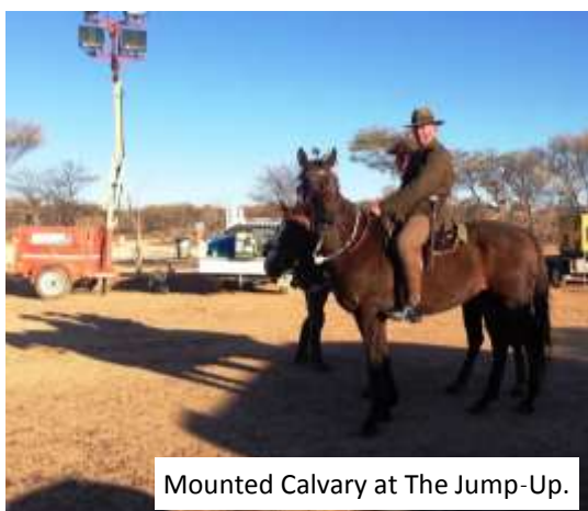
Mounted Calvary at The Jump-Up.

The dinner featured a live charity auction with funds going directly to the welfare sections of 7th Brigade (Enoggera), 3rd Brigade (Townsville) and the Australian Special Air Services Qld Assoc. Funds raised from the auction benefited soldiers returning from active service who are in need of support.