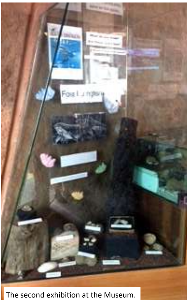
The second exhibition at the Museum.