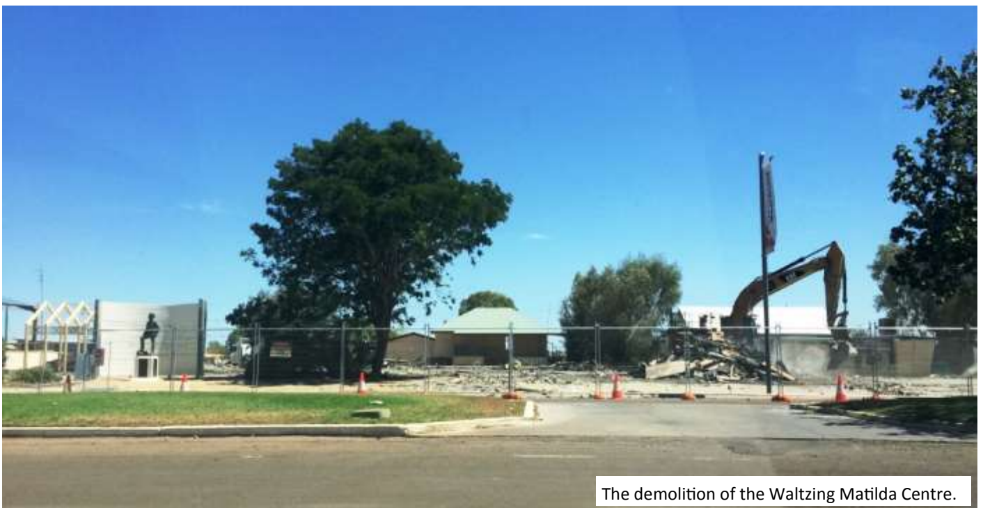
The demolition of the Waltzing Matilda Centre.

The Winton Shire Council has been actively pursuing options to demolish and rebuild this national icon. The demolition of the centre by a local company started in early November with the remains being torn down and trucked away. The Council are endeavouring to complete the redevelopment by mid 2017. In the mean time the community of Winton has held working bees to salvage some of the more damaged artefacts that will one day go on display again.