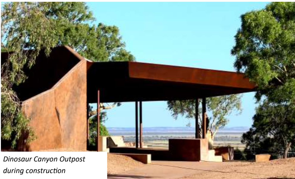
Dinosaur Canyon Outpost during construction

Formation. Dinosaur footprints overlay fragmented bones creating a realistic glimpse into in situ sauropod bones from animals that died from exposure or starvation, or were killed by predators.