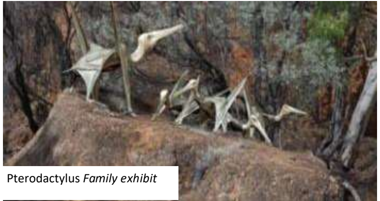
Pterodactylus Family exhibit

The Denise O’Boyle Gallery features a life-sized bronze Pterodactylus family as they may have appeared in real life around 115 million years ago.