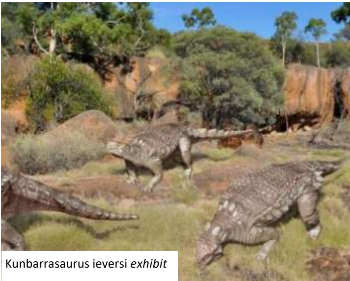
Kunbarrasaurus ieverisi exhibit

The Wavish Family Gallery was made from 3D digital reconstructions by Travis Tischler and features the Dinosaur Stampede exhibit including 24 small dinosaurs leaping across a chasm in a desperate bid to escape the clutches of a 5m long theropod!