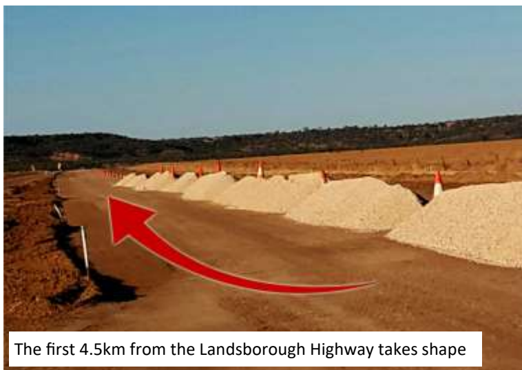
The first 4.5km from the Landsborough Highway takes shape

Ever lost a hub cap on the way up to the Museum or broken a dinner plate in the RV as you went over a particularly rough stretch of corrugation? Well, those misadventures will soon be over! The Winton Shire Council has successfully secured a commitment by the State Government for more than $2.2 million to seal the road from the Landsborough Highway to the Museum gate.