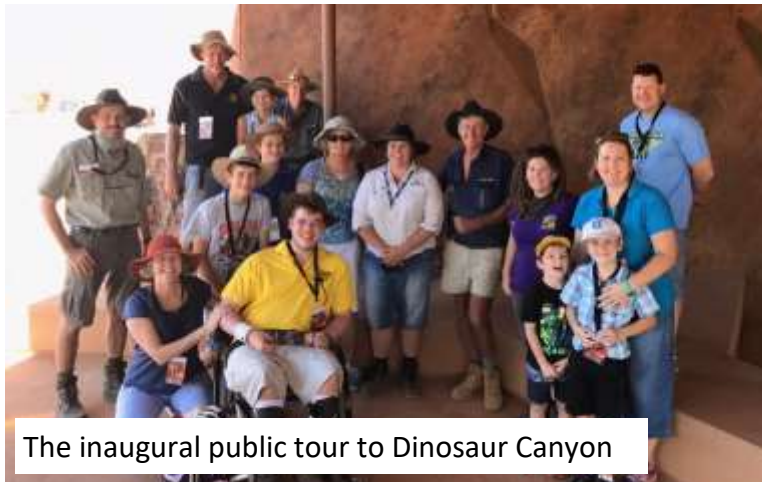
The inaugural public tour to Dinosaur Canyon