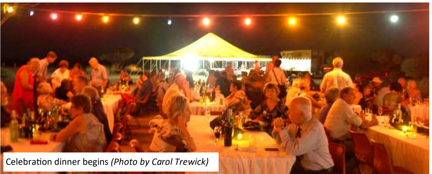
Celebration dinner begins

At 6pm the bar was opened and guests found their way back. Beautiful Outback table decorations and dinosaur-label wine set the scene as guests savoured the buffet dinner offerings by Golden Roast Caterers. The night's activities included an auction conducted by George, whose recitation of bidderbidderbidderbidderbidder was second only to his tendency to reduce bids instead of upping them!