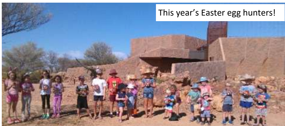
This year's Easter egg hunters!

The annual Easter Egg Hunt on The Jump-Up was a huge success – though very busy as Dinosaur Canyon was officially opened on the same day! The highly anticipated Easter Egg