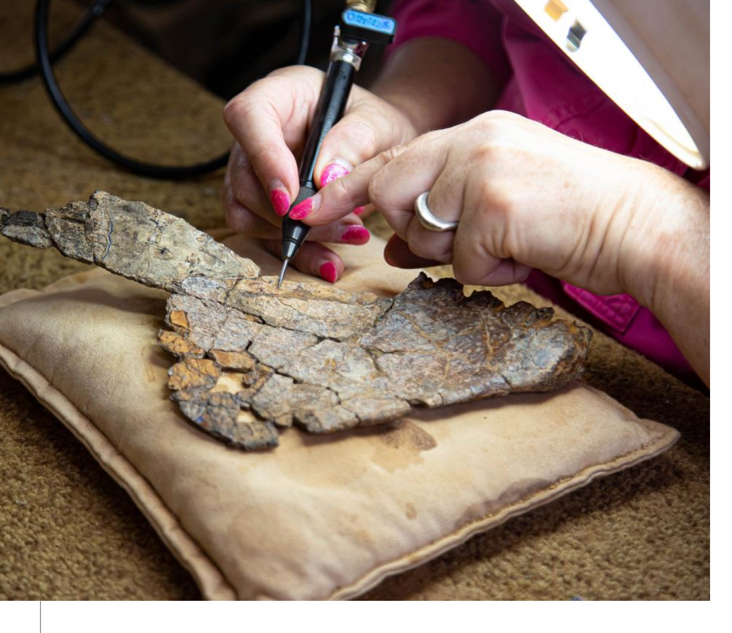
The crest and upper jaw of Ferrodraco was prepared in the Museum's laboratory. The painstaking work required the use of a wen pen and magnification light over several months.