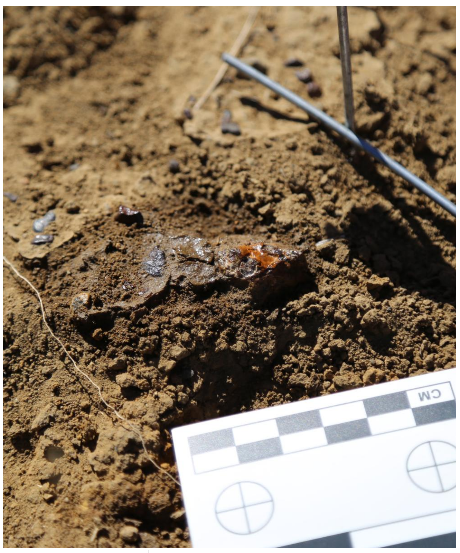
A fragment of Ferrodraco's jaw bone with tooth that was partially exposed during the dig.