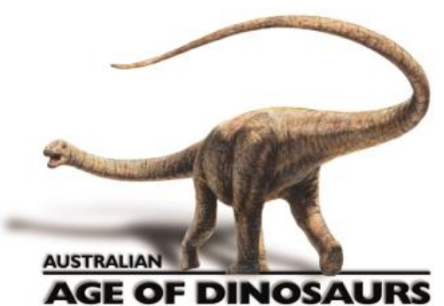
AGE OF DINOSAURS WINTON Q.

AAOD LEGACY FUND LIMITED As trustee for AAOD Legacy Fund