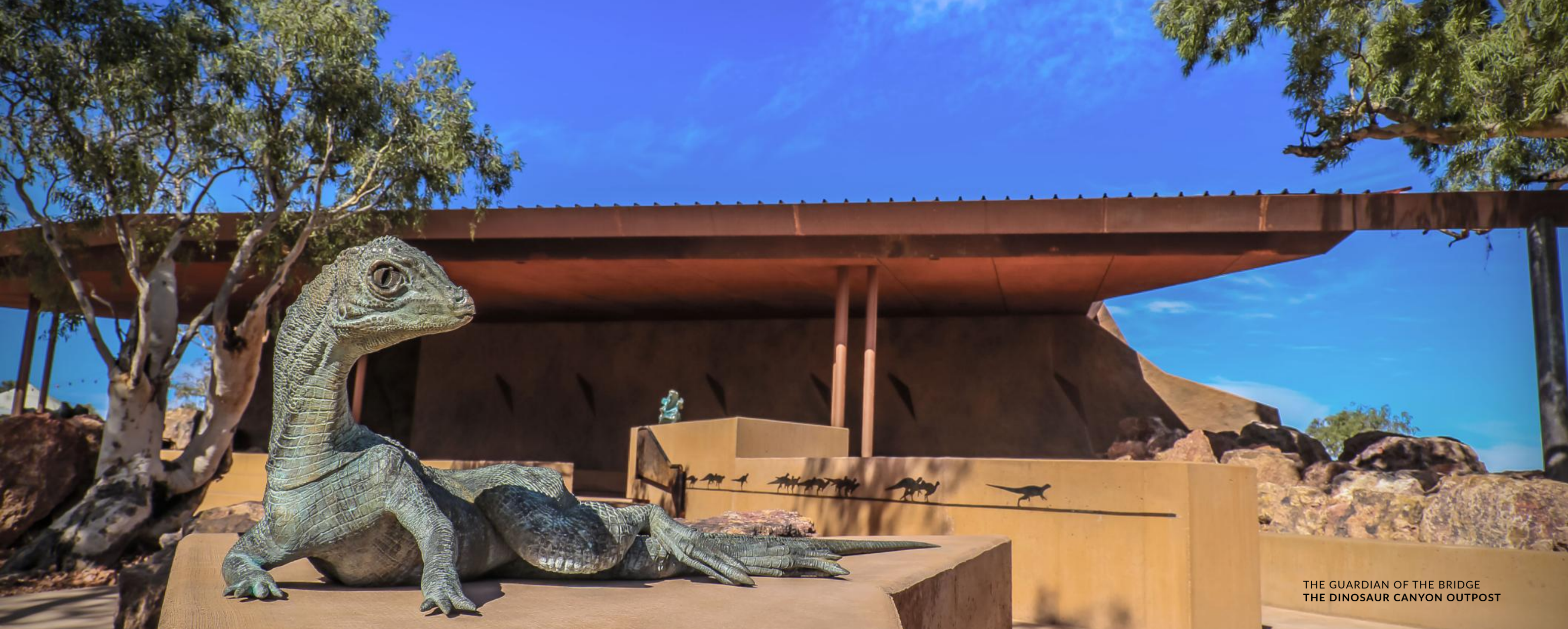
THE GUARDIAN OF THE BRIDGE THE DINOSAUR CANYON OUTPOST

The Australian Age of Dinosaurs Museum is an art gallery, nature reserve, museum and science institution. While at the Museum guests are hosted by passionate Tour Guides who break down the science in a relatable and down-to-earth way.